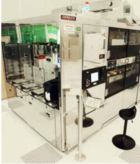
TEL ACT 12 Clean Track for fully automated 12" coating and development