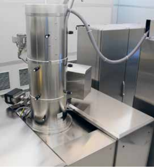
Vistec SB3050DW variable shaped E-beam for direct maskless patterning