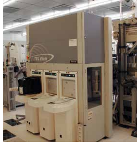
Tokyo Electron Mainframe with VIGUS chamber (specifications see below)